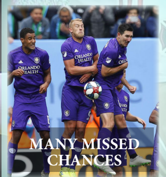
MANY MISSED CHANCES